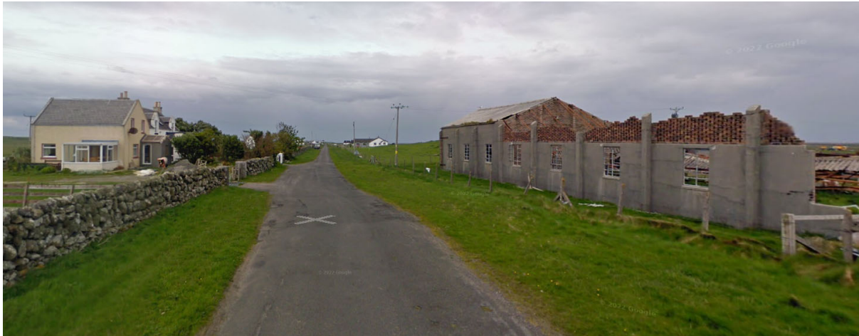
Image taken from Google Maps showing the previous building on site in 2009 in relation to the public road and neighbouring residential property.